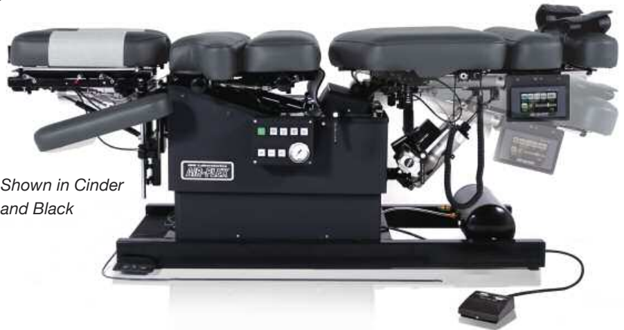
Shown in Cinder and Black

The 6.1" HD touchscreen panel (shown right) offers digital accuracy for controlled, fully repeatable treatments.