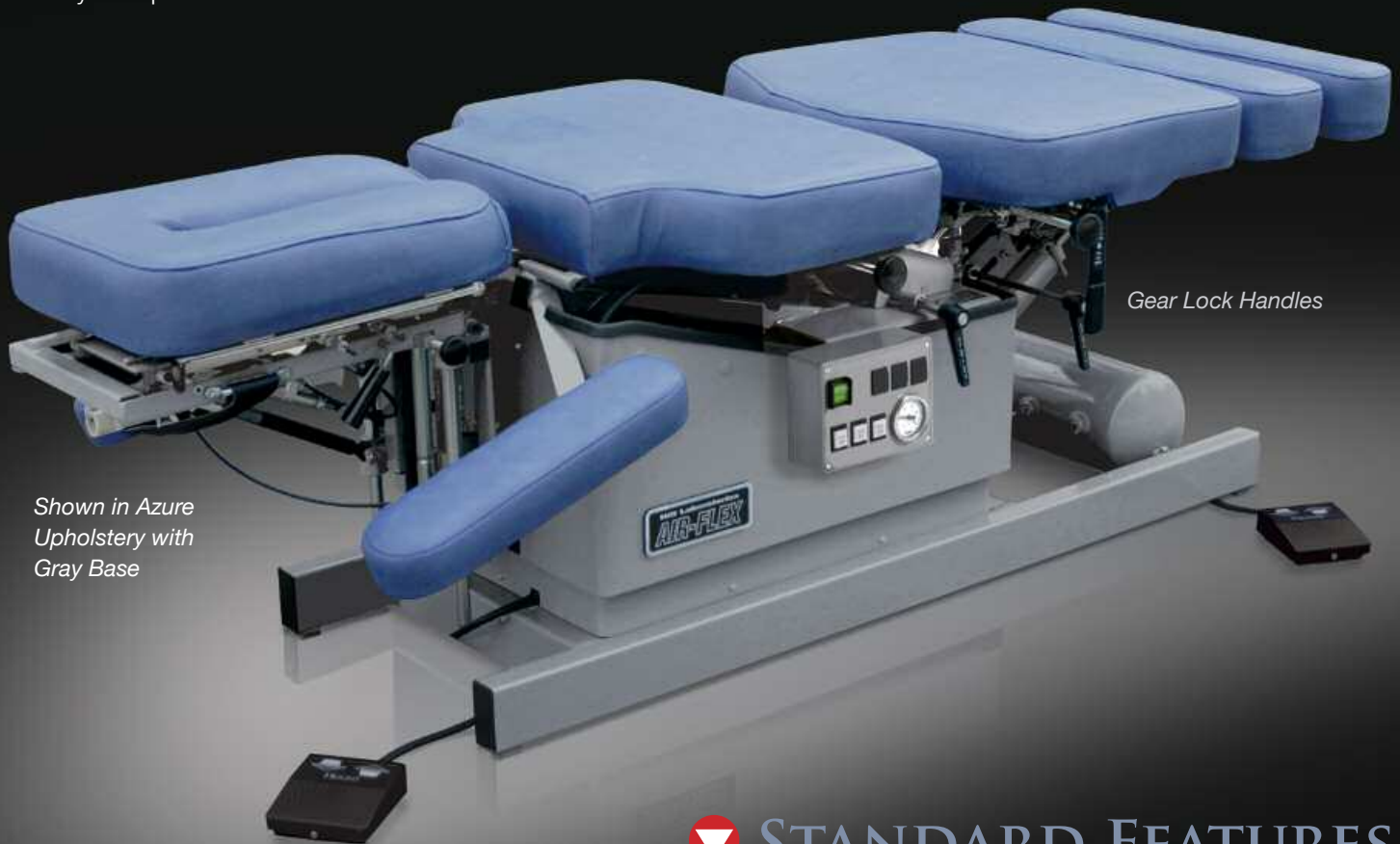
Shown in Azure Upholstery with Gray Base

The Air-Flex Table has revolutionized flexion-distraction. Once you've treated your patients with an Air-Flex, you'll never be satisfied with an ordinary flexion table again. The Standard Air-Flex features are detailed below. Choose from the many available options to customize the Air-Flex for your specific needs.