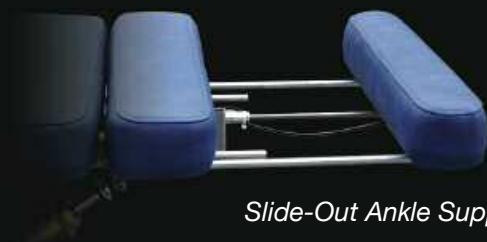
Slide-Out Ankle Support