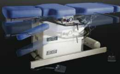
Electric adjustable height controlled by a foot pedal