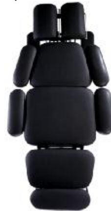
Chiropractic top / side ext