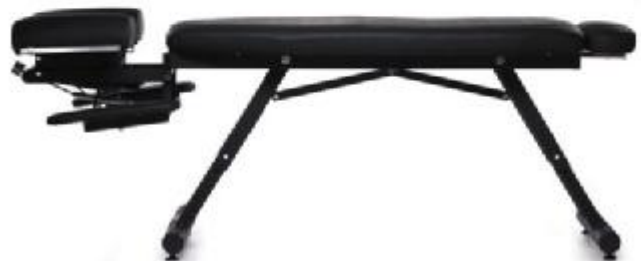
Techniques IL Stationary Table With 1 piece top