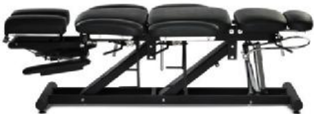
Table Shown With Pump Elevation