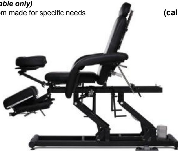
EL - base shown with Multi-Therapist