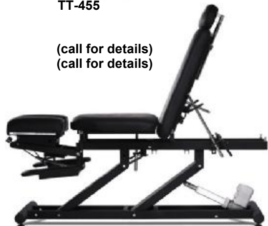
Table Shown with Electric Elevation / Back Rest