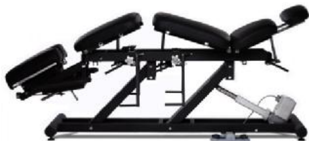
Table Shown with Electric Elevation