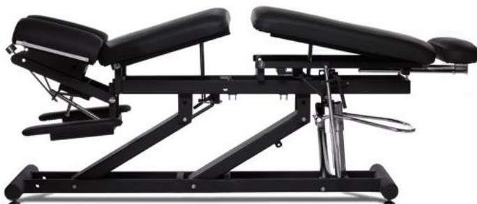
Table Shown With Pump Elevation