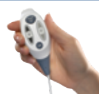
Operator Remote (ch 1/2)